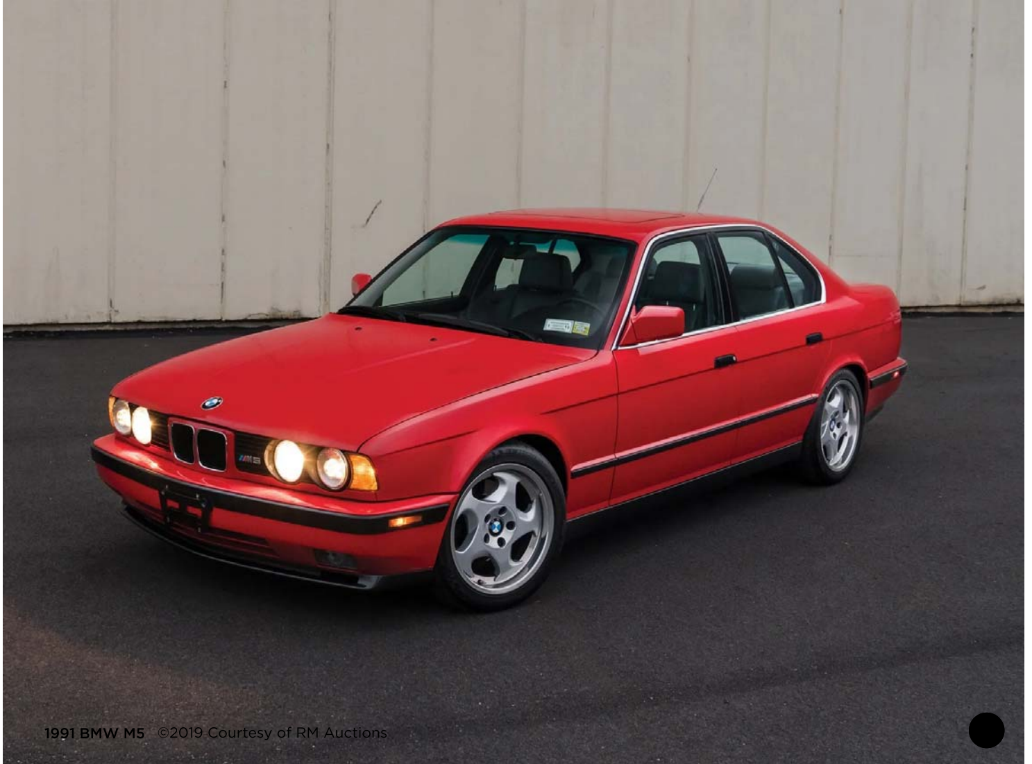
1991 BMW M5